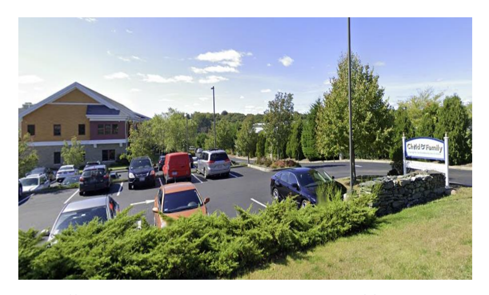
"Many social service offices cannot be readily accessed from Newport using public transportation"