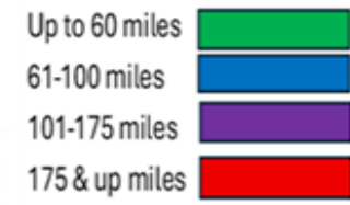
Service Area Map

Our Service Area Covers: 47,302 sq. miles Slightly larger than PA & Slightly smaller than MS